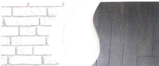
FROM LEFT Brick Wall vinyl wallpaper in White, £20 per 10m roll, B&Q; White Cotton matt emulsion, £21.29 for 2.5l, Dulux; and Herringbone Black Oak engineered-wood flooring, £69.99 per sq m, Wickes